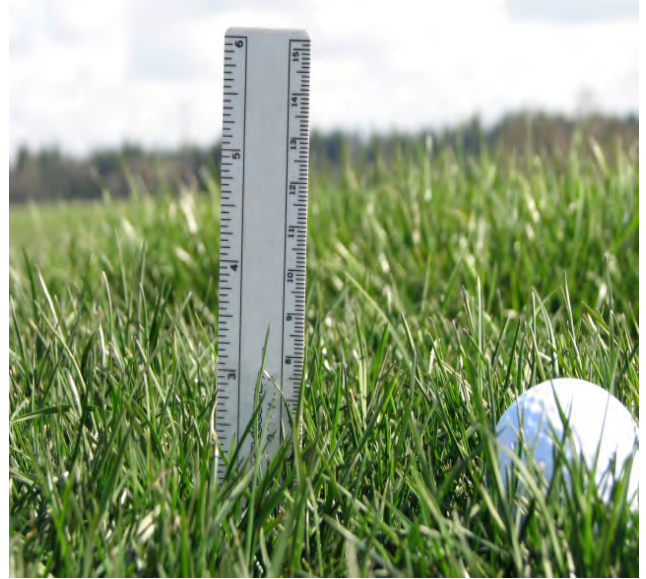
SRL – about 75 mm

SRL in trials showed 40% less “top growth” than standard lawns meaning less mowing