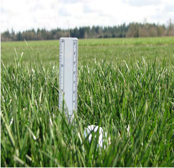
Normal turf type ryegrass – about 125 mm