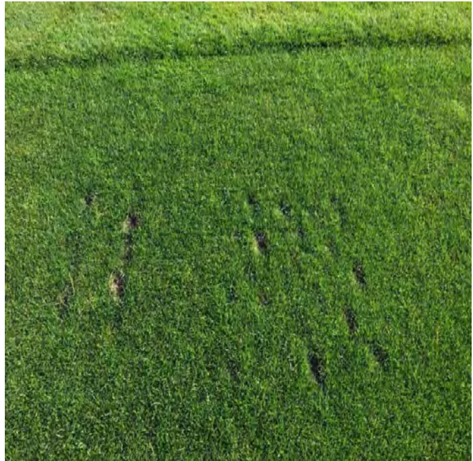
30 Days Later

CREEPING · SPREADING S ELF R EPAIRING L AWN